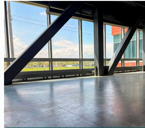
MODERN INDUSTRIAL DESIGN