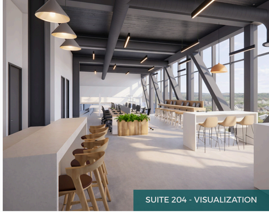
SUITE 204 - VISUALIZATION